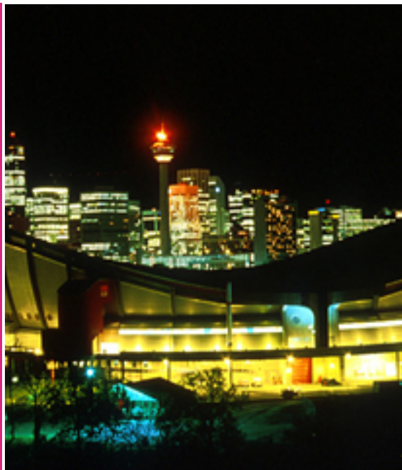
Calgary The host of the 2006 CPA conference

These are just some ideas, once again, feel free to email suggestions or content you have for a future newsletter issue to alitivack@yorku.ca