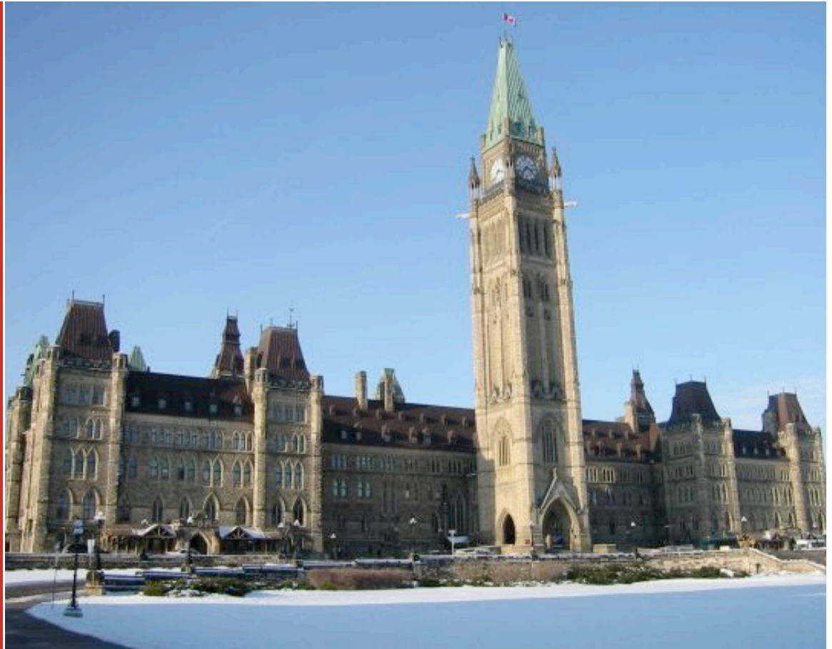
Ottawa, Canada's capitol, the host of this years CPA convention