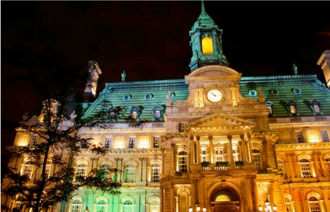
Champs de Mars - Montreal