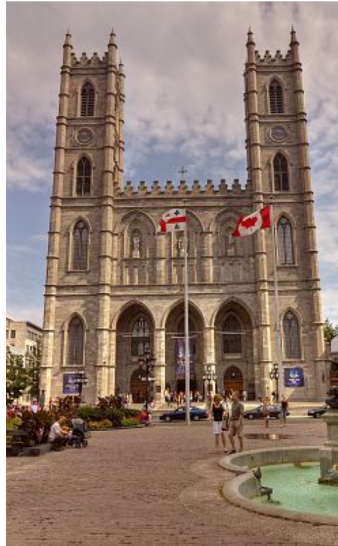
Basilique Notre Dame - Montreal

A great lineup of speakers is being planned and we once again expect to have the preconference poster session for researchers to present their most recent research findings. We encourage you to attend the preconference and we hope to see you there. Also, for those who cannot attend, please encourage your colleagues and students to attend this event by directing them to our section website.