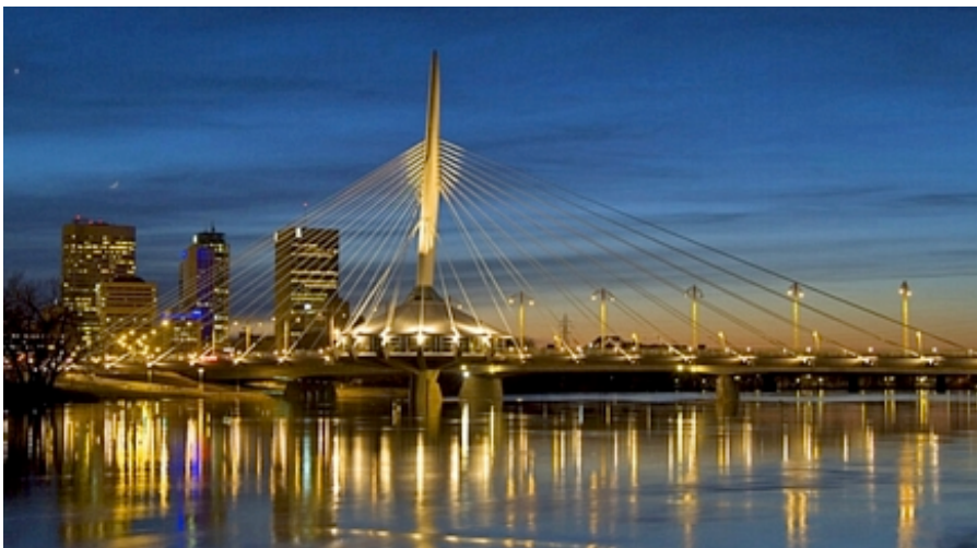
Winnipeg - Site of the 2010 CPA conference

Please check in at the pre-conference web site for updates and further information as it becomes available: http://www.cpassp.ca/precon.htm