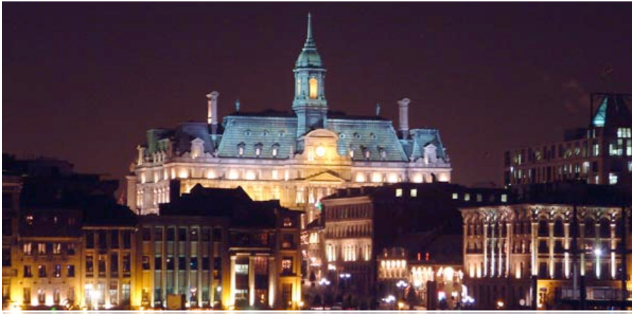
Montreal - Site of the 2009 CPA conference