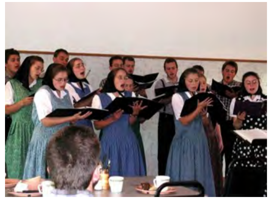
Hutterite Women's Choir

The role of the school psychologist in the southwest is an expansive one. A primary function continues to be psychoeducational assessment to identify the learning needs of students. We are also asked for intervention support through functional behavioural analysis (FBA) and behaviour intervention plans (BIP) for students with emotional and behavioural difficulties. We further consult with our school teams to support diverse learners, and at times, provide professional development training in the areas of learning disabilities, classroom management, culturally diverse learners, as well as issues on inclusive practices for Sexual Orientation and Gender Identity (SOGI) diversity. Our region is also unique as we serve 30 Hutterian schools, schools within communities of Anabaptist Christians (Hutterites) who have established communal agricultural colonies. Hutterian students are multilingual and represent approximately 10% of our student population. Due to the decreasing number of psychologists in the region, school psychologists are often being asked to complete tasks for local family doctors and pediatricians (e.g., differential diagnosis) as well as forensic work (e.g., adult guardianship affidavits, child custody recommendations).