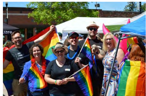
Swift Current's First Pride March (City of Swift Current, 2017)

The view from here? Well, it is one where the scope of practice is broad, the number of practitioners is few, and the client population