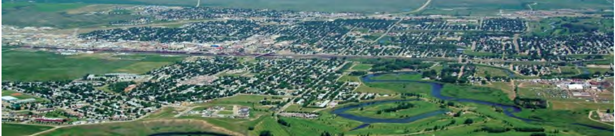
City of Swift Current, 2019

I started my practice as a school psychologist in Swift Current, SK, 8 years ago. I often tell people who ask, I moved to Swift Current “for a good time, not a long time,” after having completed graduate studies in my hometown of Saskatoon at the University of Saskatchewan. I thought I would get my start here, and then move back. Since that time, I got married, built a house, and started a private practice. I’m getting pretty close to being a local. In fact, when I was awarded a SSHRC doctoral fellowship, the local newspaper read “Swift Current Man Awarded a Doctoral Fellowship.” I guess I have finally arrived, I am truly a “Swift Current Man.”