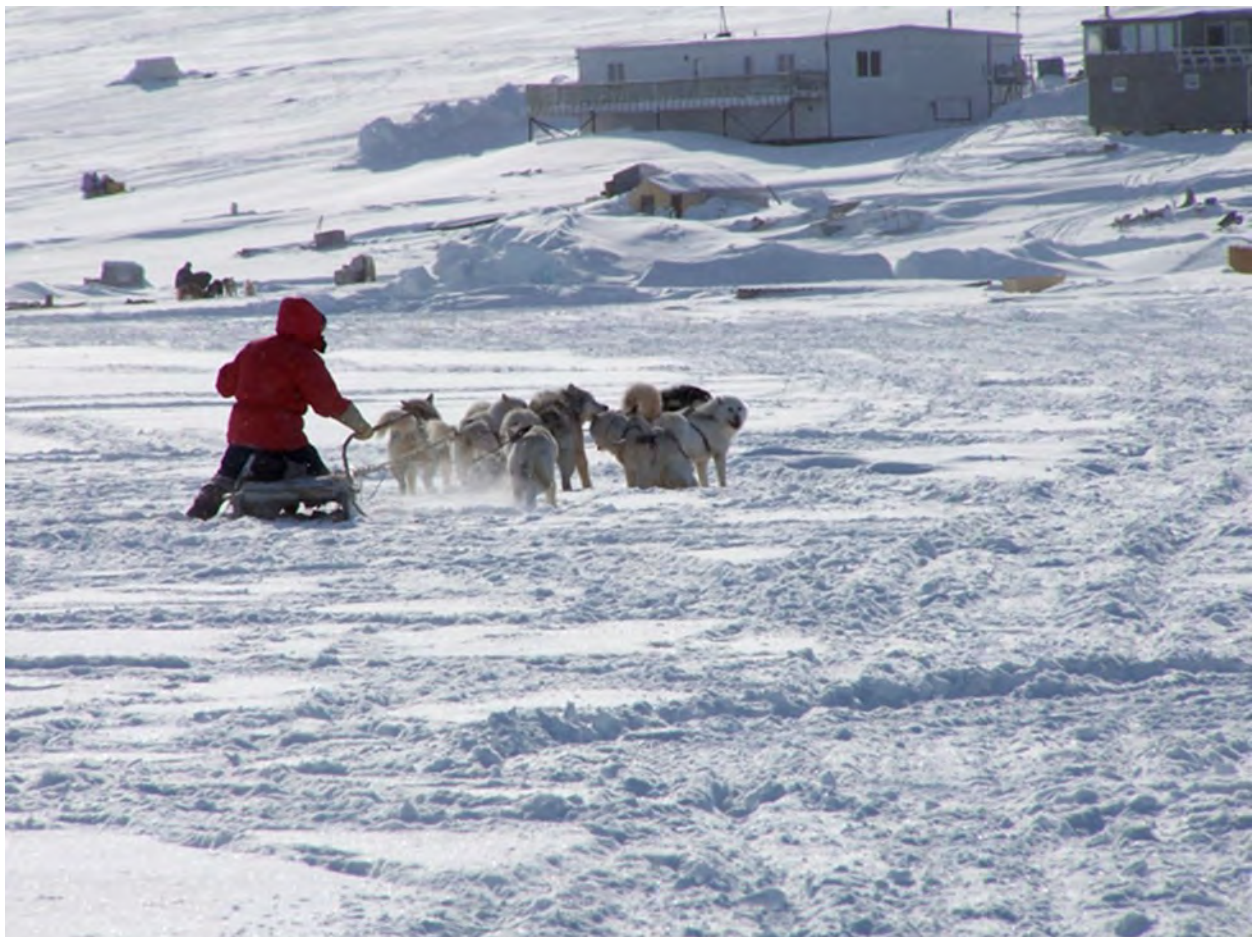
In Igloolik, Nunavut